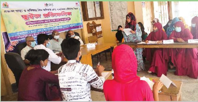
Debate competition on child marriage is taking place.

SKS Foundation organized a Quiz & Debate Competition with participation of local adolescent girls & boys with a view to enriching their awareness & knowledge on reproductive health, child rights and prevention of child marriage. The Competition was held on 23 June 2021 at Boali UP Complex, Sadar, Gaibandha under SKS' Action for Socio-economic Security and Rights for Excluded and Marginalized Women and Girls (ASSR for EMWG) project, supported by UKAid in technical corporation with Manusher Jonmo Foundation .