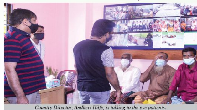
Country Director, Andheri Hilfe, is talking to the eye patients.