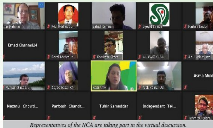
Representatives of the NCA are taking part in the virtual discussion.