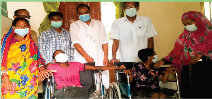
Chairman, Saghata union is distributing the assistive devices.

SKS Foundation has supported 19 persons with disabilities distributing assistive devices to the poorest persons in Saghata union of Saghata and Udakhali union of Fulchhari upazila under Gaibandha. The distribution took place on 3 June 2021 at Saghatra Probin Samajik Kendra (center for the elders). The persons with disabilities from respective unions got assistive devices according to their disabilities while 2 wheelchairs, 4 hearing aids, 10 walking sticks, 2 black glasses and a commode chair were distributed.