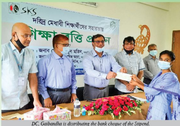
DC, Gaibandha is distributing the bank cheque of the Stipend.

Under its Scholarship Program, SKS Foundation provided 57 poor but talented HSC students with education stipend in partnership with Palli Karma-Sahayak Foundation (PKSF). A total of Tk. 684,000 was distributed as Stipend while each of the students got a bank cheque of Tk. 12,000. The Stipend Giving Ceremony was held on 17 June 2021 at the SKS School & College Conference Hall, Uttar Horin Singha, Gaibandha.