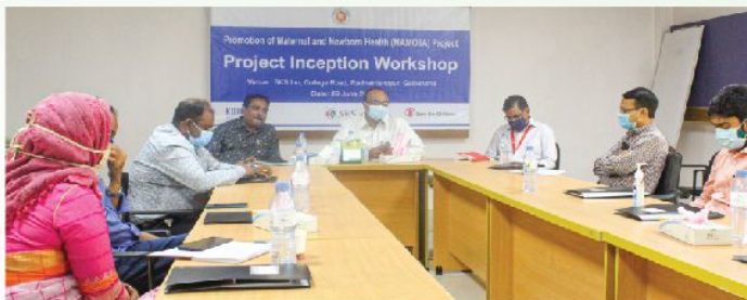
The Inception Workshop is taking place in participation of health & family planning officials.