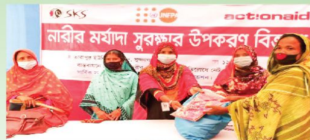
Women are receiving the dignity kits.

During the monsoon flood 2020, the poor and vulnerable people of Gaibandha Sadar, Sagghata, Sundarganj & Fulchhari upazila suffered a lot and still facing the effect of sustained damage. Alongside, COVID-19 has worsened the situation and deteriorated the health of people, particularly the destitute women's physical & mental health in these areas. Considering this situation, the GBV Network, Gaibandha distributed a total of 2,172 women's protective and dignity kits to the poor and disadvantaged women. Out of the total packages, 1,822 kits were distributed covering a no. of days in March 2021 and 350 kits were distributed on 12 May 2021. The poor women from 8 unions namely Belka, Tarapur, Gazaria, Fulchhari, Fazlupur, Uria, Kamalarpar & Jumarbari of Sagghata, Sundarganj, and Fulchhari upazila got these dignity kits. (See page 3)