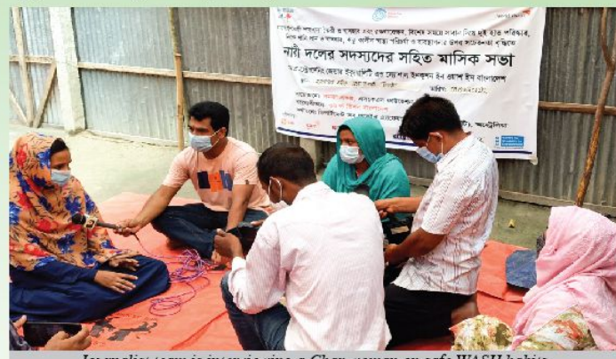
Journalist team is interviewing a Char woman on safe WASH habits.