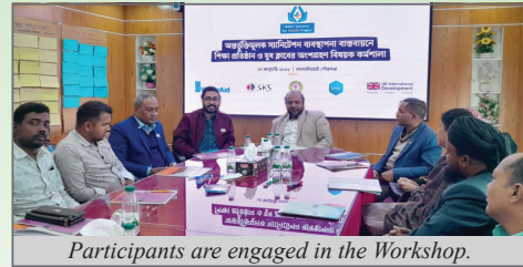
Participants are engaged in the Workshop.

Headmasters and 2 other teachers from each of 5 secondary schools in the municipal area, and 2 executive members from each of 4 youth clubs, along with municipal officials, attended the workshop. The participants identified key challenges in line with education and youth instructional roles in implementing inclusive sanitation in Lalmonirhat Municipality. They highlighted a shortage of adequate sanitation facilities, while existing facilities were often unsuitable for women and people with disabilities, falling short of inclusive standards. To address these