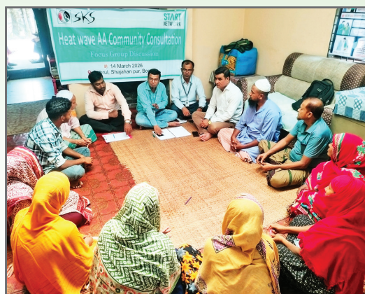
The community people are engaged in the Consultation.

SKS Foundation, with support from Start Fund Bangladesh, organized a consultation titled Heat Wave Anticipatory Action Community Consultation on 14 March 2026, in Shabrul and Olahali villages