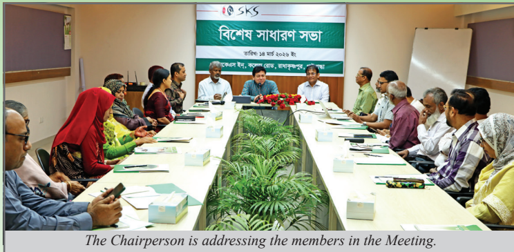
The Chairperson is addressing the members in the Meeting.

SKS Foundation elected its new Executive Committee for the 2026-2029 term. The election was conducted at a Special General Meeting held on 14 March 2026. A total of 23 members from the General Council attended the Meeting at SKS Inn, Gaibandha.