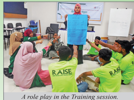
A role play in the Training session.

A total of 100 (61 male & 39 female) took part in the training. This Life Skills training was designed to complement participants’ technical skills and prepare them for their employment. The training focused on key personal and business competencies, including communication, negotiation, conflict management, leadership, and positive thinking. The sessions were held in 4 batches on 1-12 March 2026 at SKS Resource Centre in Bharatkhal, Saghata, Gaibandha.