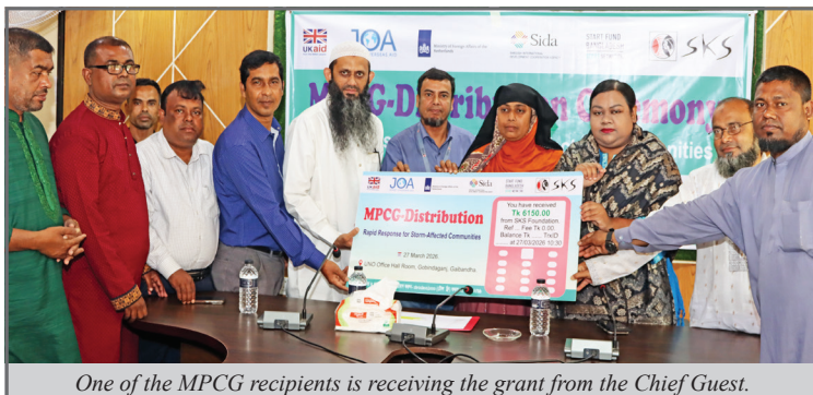
One of the MPCG recipients is receiving the grant from the Chief Guest.

The support was given under the “Rapid Response for Storm-Affected Communities” project, in which each selected family received Tk. 6,000. An additional Tk. 20,000 was provided to 40 severely affected households for house repairs, disbursed through mobile financial services. In addition to cash support, the project includes technical guidance for housing reconstruction and mental health support to the families to address disaster-related stress and ensure overall well-being. The support covers affected families in Kukrail and Dublagari villages under wards 3 and 6 of the Union.