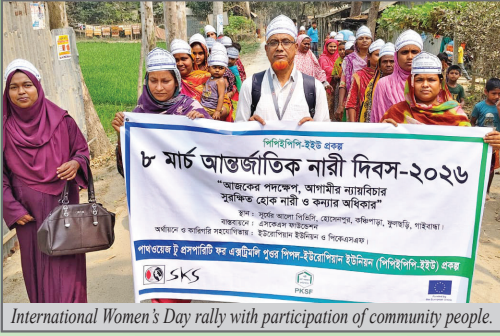
International Women's Day rally with participation of community people.

SKS Foundation observed International Women's Day 2026 on 8 March 2026 through a series of programs like rallies, discussions, and youth gatherings across its