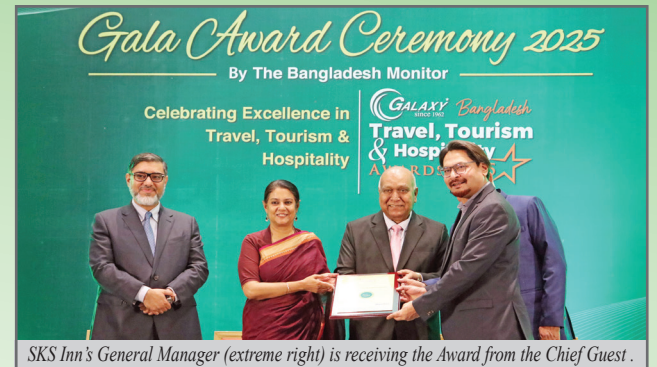
SKS Inn’s General Manager (extreme right) is receiving the Award from the Chief Guest.