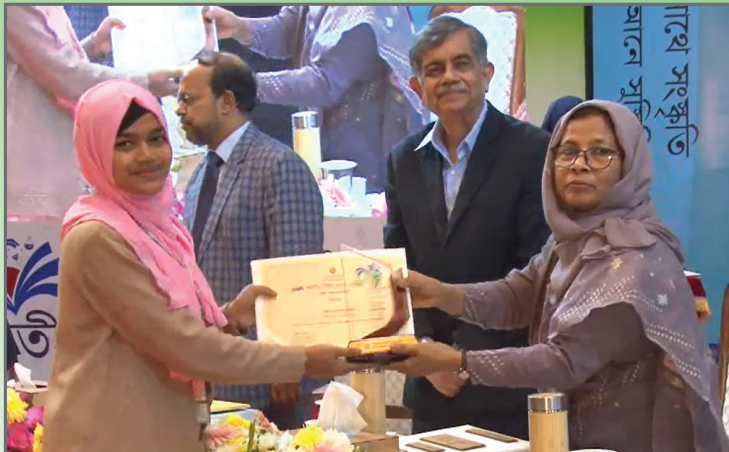
The team leader is receiving a crest & certificate from the Secretary of the Secondary & Higher Education Division.

SKS School & College won second place in the Group-B category of the National Wall Magazine Competition held in National Education Week 2026. A 6-member student team from SKS School & College earned the recognition for their wall magazine titled “Under One Sky.” Under this title, students highlighted the culture and lifestyles of Bangladesh’s ethnic communities while also portraying the struggles of street children.