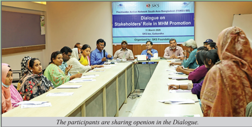
The participants are sharing opinion in the Dialogue.

FANSA Bangladesh through its secretariat- SKS Foundation organized a dialogue titled “Dialogue on Stakeholders’ Role in MHM Promotion” on 11 March 2026 at SKS Inn, Gaibandha.